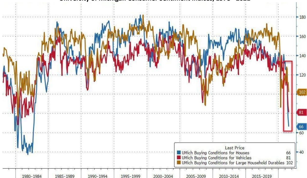
University of Michigan Consumer Sentiment Indices, 1978 - 2021

As we continue to monitor the general economic environment, we note the strong earnings for the S&P during Q2 – reported earnings so far indicate a year-on-year growth rate of 85%, the highest since Q4 2009. This is unsurprising as they both represent rebounds from periods of severe economic recession. What stands in stark contrast, in our view, is the profound shift in consumer sentiment in the latest surveys. A more granular look beyond headline consumer sentiment, which is now at a five-month low, shows that spending intentions on houses, autos, and large household durable goods have crashed to multi-decade lows. We believe this portends either another recession or more rounds of government stimulus programs, either of which could inject uncertainty and volatility into the so far highly blasé equity and fixed income markets.